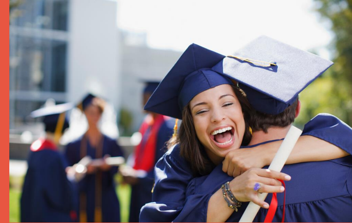
Personal development & growth