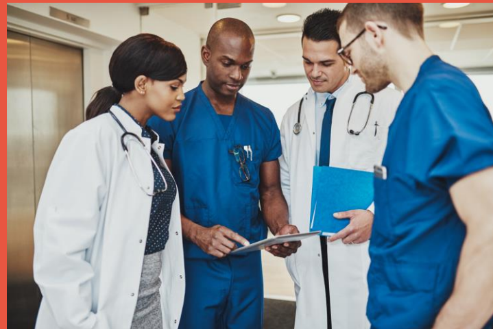
Training for a career