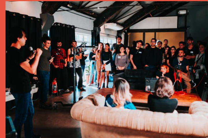
Knowledge & skills