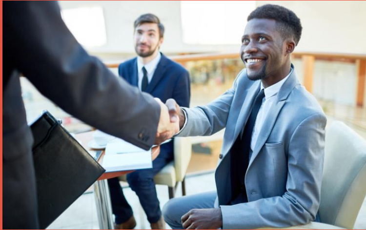
Building a network