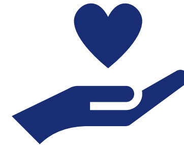
Employee Wellbeing Hub including EAP and Staff Welfare Officer