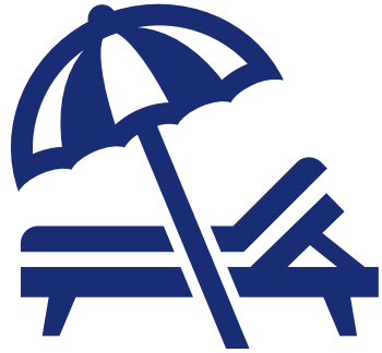
Generous Annual Leave Entitlement